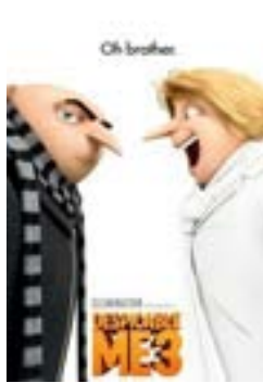
Despicable Me 3