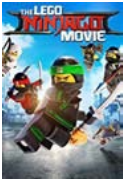
The Lego Ninjago Movie